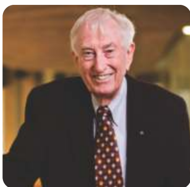
Laureate Professor Peter Doherty Noble prize in Physiology & Medicine 1996 Doherty Institute, Melbourne, Australia